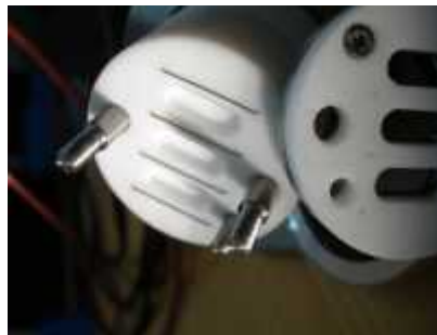
Figure 3: Probe head with the four platinum electrodes and the cap