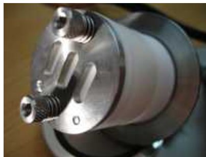
Figure 4: Probe head with assembled cap, spring and knurled nuts

The targeted relative humidity can be achieved by setting corresponding temperatures of the sample chamber, adapter and water reservoir. The equilibrium of temperature and humidification are typically obtained within 1 hour. However, depending on the membrane type, reaching equilibrium between humidified air and water vapor uptake of membrane could take longer.