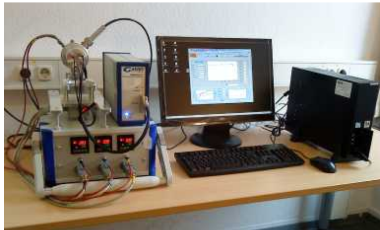
Figure 5: Set-Up of the complete MK 3 measuring system with Gamry R 600 and PC