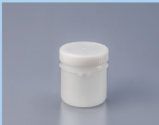
300 ml container