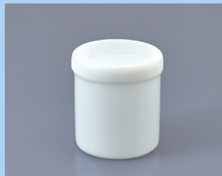
550 ml container