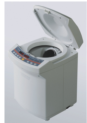
Figure 1: Thinky Mixer ARM-310

Several types of mixing methods were examined. One of the major issues during this slurry making is the uniform mixing of the above-mentioned components. For this, the Thinky Mixer- THINKY ARM-310 (Figure 1) is used for this application to ensure homogeneous mixing of the electrode material, conducting additive and binder. Figure 2 shows the slurry making procedure, where the electrode materials were dissolved in the solvent by mixing for 5 min at 2000 rpm using the Thinky Mixer. Through centrifugation and simultaneous self-rotation of the mixing bowl, this model offers maximum possible mixing and thus homogeneous electrode material composite.